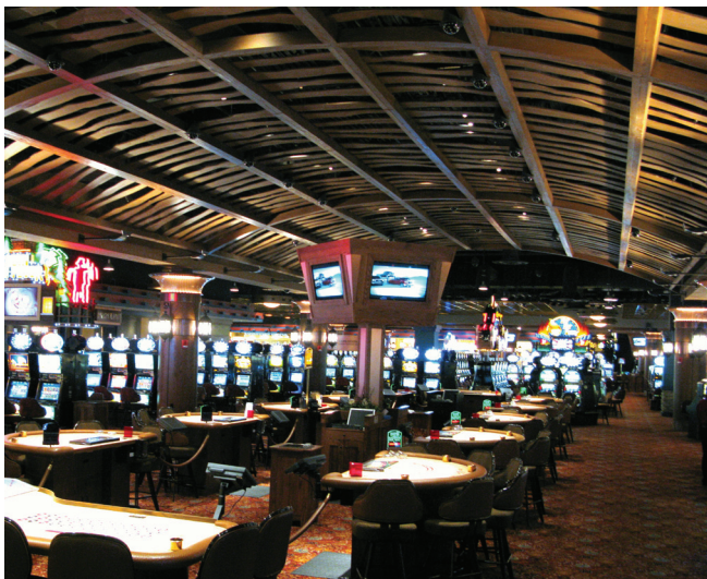
FAUX CEILING BEAMS & TRIM DETAILS

Finish: Danish Walnut Stain Surface: Oak Grain Sample Size: 4" x 5" Sample Code: 98132