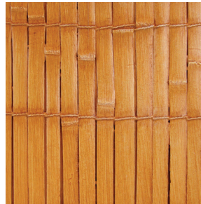
REFLECTIONS CAFE, NEW JERSEY