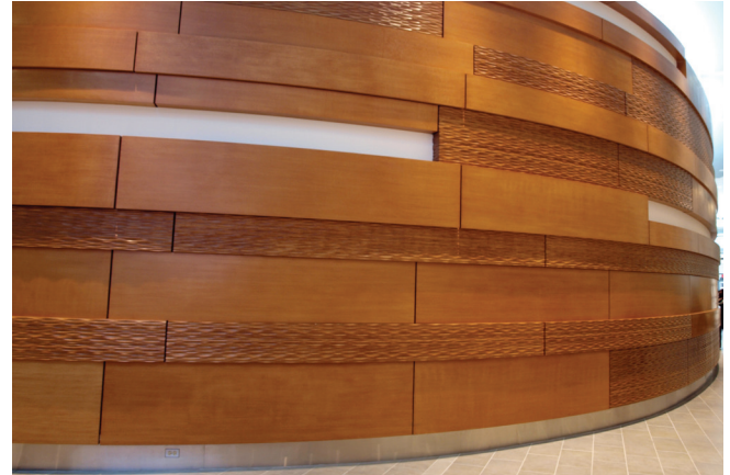
CURVED FEATURE WALL

Formglas Products Ltd. 2 Champagne Drive, Suite 200 Toronto, Ontario, Canada M3J 2C5 T: 1.866.635.8030 F: 416.635.6588 Web: formglas.com Email: info@formglas.com