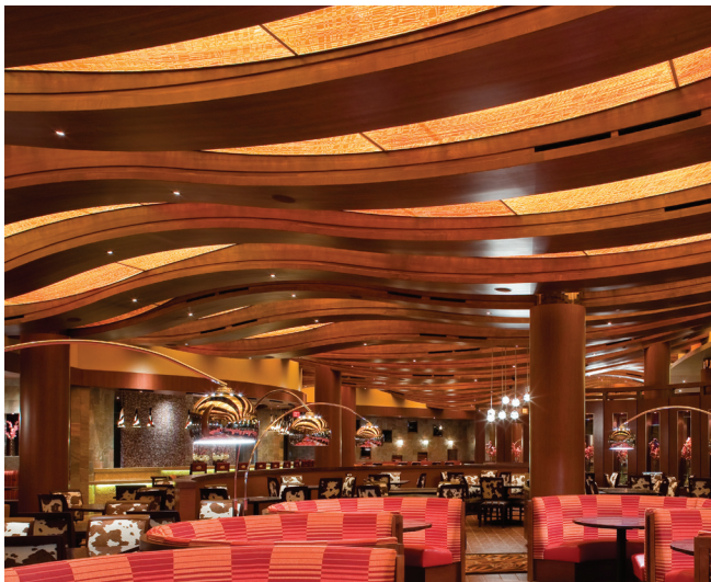
CURVED FEATURE CEILING COMPONENTS

Formglas is able to custom fabricate Woodgrane™ to match a number of wood grains and colors. Please contact your local sales representative to learn more or discuss custom requirements for a specific project.